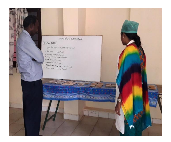
Food Safety officer- Inspection